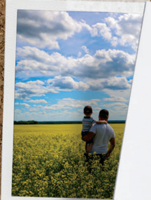
Voice of Manitoba Canola Farmers to Canadian Consumers