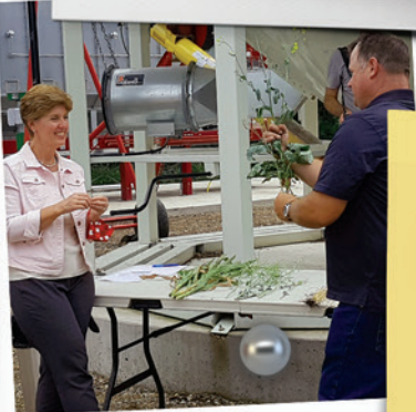
Voice of Manitoba canola farmers to government and industry