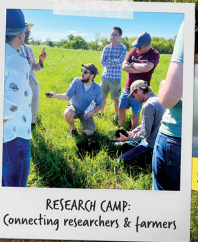
RESEARCH CAMP: Connecting researchers & farmers

Nitrogen rate Seeding rate Bioinoculant trial