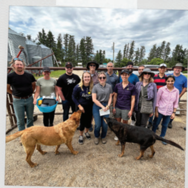
RESEARCH CAMP: Connecting researchers to the farm