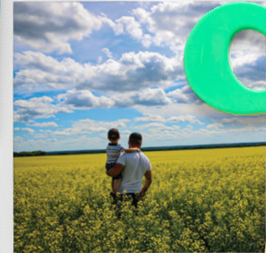
Voice of Manitoba Canola Farmers to Canadian Consumers