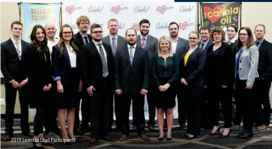
2019 Learn to Lead Participants